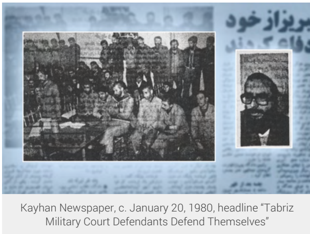
Kayhan Newspaper, c. January 20, 1980, headline "Tabriz Military Court Defendants Defend Themselves"