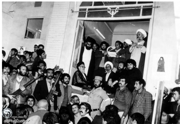
Ayatollah Shariatmadari with supporters in Qom.

On December 8, Ayatollah Shariatmadari reminded Mehdi Bazargan via telegram that he had succeeded in mitigating public tension in Azerbaijan, but that the government had failed to follow through on its promises and that government representatives continued to make inflammatory statements. He stressed that if the situation continued, he "would not be responsible" for what happened in Azerbaijan. 90 He then dispatched a delegation to Tabriz to investigate the situation, including at the radio and television station. That evening, he had a 30-minute private meeting with Ayatollah Khomeini at the latter's residence, which he described as "good and effective." 91