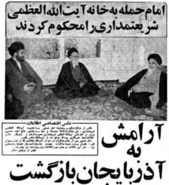
Ettelaat Newspaper, December 8, 1979: "Imam Condemns Attack on Shariatmadari's House - Calm Returns to Azerbaijan."

The station also aired an MPIRP statement demanding a say for Ayatollah Shariatmadari in the nomination of local officials. The statement demanded more rights for Azerbaijani peoples, and that they be granted the same rights as the people of Kurdistan. At the time, following a period of serious unrest the previous summer, the central government was in negotiations with Kurds regarding their demands for autonomy. The statement also called for the prosecution of the Qom attackers and the arrest of those responsible for the bloodshed earlier that day. 67