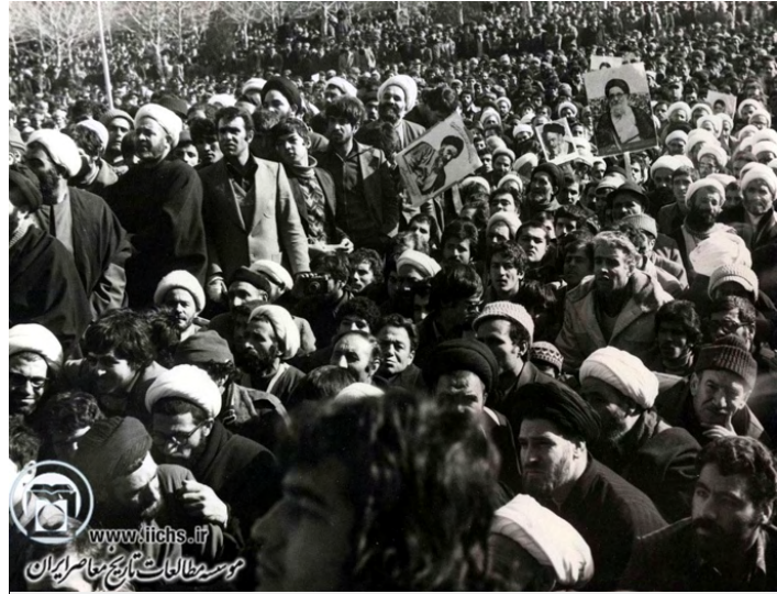
Members of the Muslim People's Islamic Republic Party gather in Tabriz. Institute for Iranian Contemporary Historical Studies, undated.

Ali Akbar Hashemi Rafsanjani, a Revolutionary Council member and close ally of Ayatollah Khomeini, acknowledged in an interview with German TV that the referendum was boycotted by the leftist groups. 54 He failed to mention, however, critical details about the breadth and nature of the opposition, for example how groups such as the National Front and the Pan Iranist Party – questioning the legitimacy of the Assembly of Experts, the fairness of its proceedings, the authoritarian control of the Revolutionary Council (including over the Assembly's election), and the ambiguity to the separation of powers and recognition of national sovereignty – had also called on Ayatollah Khomeini to suspend the referendum. 55 While conceding that there had been voter abstention among Sunnis and Turkish-language speaking Iranians who followed Ayatollah Shariatmadari, Rafsanjani omitted mention of the considerable opposition to the concept of velayat-e faqih among clerics, Ayatollahs, and grand Ayatollahs, including but not limited to Abolfazl Zanjani, Hasan Lahuti, Abdollah Shirazi, Mohammad Reza Golpayegani, Hasan Tabatabai Qommi, Morteza Haeri Yazdi, Abolqasem Khoei, and Ali Tehrani, some of whom had even refused to participate in the March 1979 referendum. 56