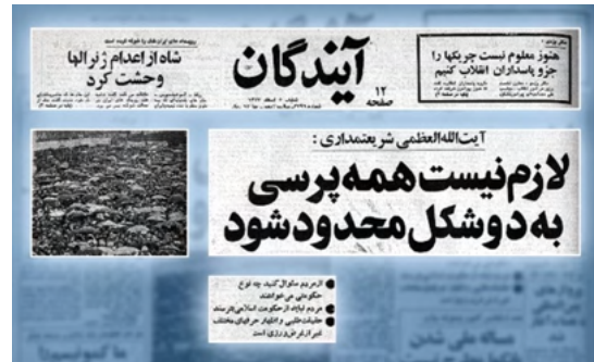
Ayandegan Newspaper, February 24, 1979, "Ayatollah Shariatmadari: There's no Need for the Referendum to be Limited to Two Options"

The revolution did nothing to ease tension between the two clerics. When Ayatollah Khomeini put forward a referendum in March 1979 limiting voters to approving or rejecting the Islamic Republic, Ayatollah Shariatmadari objected. Though he ended up participating in the referendum in support of the Islamic Republic, he disputed the referendum's question, suggesting instead "Ask people what kind of a regime they want, and let the people respond." 7