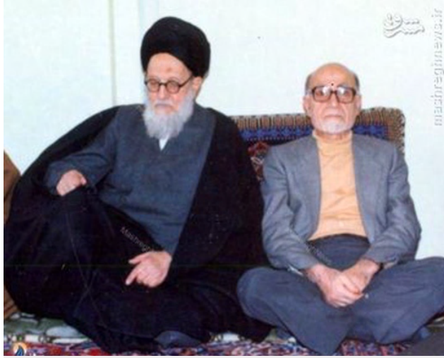
Ayatollah Shariatmadari and Mehdi Bazargan.

that external forces were to blame – and to fear – for unrest and violence. He emphasized that people should be vigilant not to enable “foreign agents and the rotten roots of supporters of the former regime,” as “the dear country and the great Islam are facing the bloodsucking America.” Chalking up the attack on Ayatollah Shariatmadari’s house to the work of nondescript “plotters,” he urged the public to “avoid divisive issues” and focus on the “great enemy.” 70