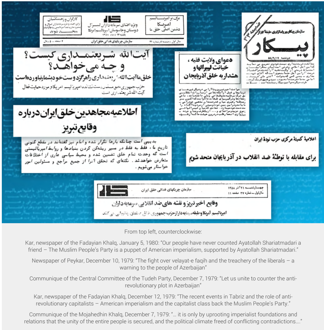
From top left, counterclockwise:

Kar, newspaper of the Fadayan Khalq, January 5, 1980: “Our people have never counted Ayatollah Shariatmadari a friend – The Muslim People’s Party is a puppet of American imperialism, supported by Ayatollah Shariatmadari.”