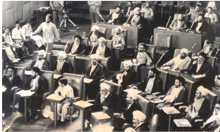
The Assembly of Constitutional Experts.