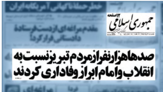
Islamic Republic Newspaper, undated. "Hundreds of Thousands of the People of Tabriz Pledge Allegiance to the Revolution and the Imam"

On December 15, the Public Relations Office of the Revolutionary Guards of Qom released a statement announcing the arrest of one of Ayatollah Shariatmadari's guards for the December 5 murder of the guard on the latter's roof. 110 The arrested guard was tried two months later. According to the revolutionary court of Qom, he was convicted of manslaughter and sentenced to pay blood money based on "evidence and testimony." Details on the nature and extent of evidence against him were left unexplained, leaving serious doubts regarding the guilt of the accused. 111