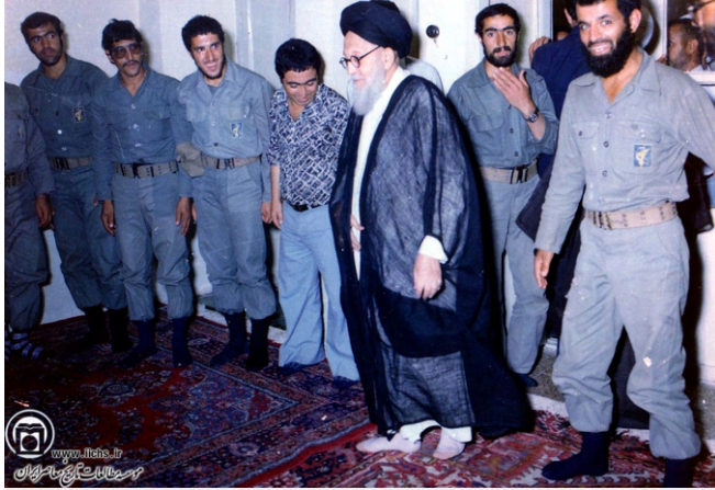
Ayatollah Shariatmadari with members of the Islamic Revolutionary Guard Corp, Qom. 1979 or 1980.

militiaman who did not want to be identified for fear of government reprisal told the AP reporter: “We don’t want brothers to kill each other, but we want those people that were arrested to be released, and then we will release these nine.” 115