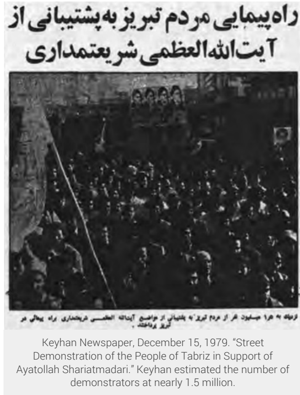
Keyhan Newspaper, December 15, 1979. “Street Demonstration of the People of Tabriz in Support of Ayatollah Shariatmadari.” Keyhan estimated the number of demonstrators at nearly 1.5 million.

One cleric, among others present in the protest, insisted that they were not counterrevolutionaries or secessionists, and that there were no foreigners among them, stating “We are Muslim and revolutionary.” The cleric also pointed out that the national radio television had given ample airtime to clerics’ criticisms of protesters without ever broadcasting the statements of Ayatollah Shariatmadari. 109