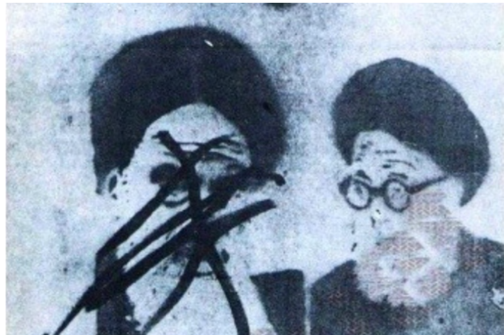
Image of protest graffiti published by the Turkish newspaper Milliyet, undated.