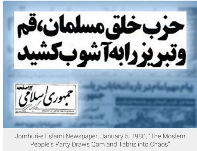
Jomhuri-e Eslami Newspaper, January 5, 1980, "The Moslem People's Party Draws Qom and Tabriz into Chaos"