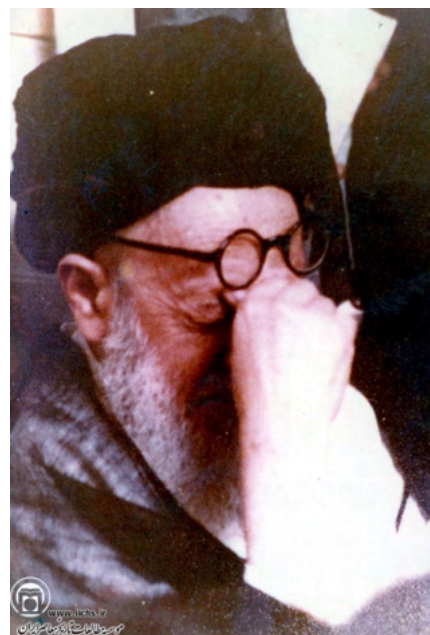
Ayatollah Shariatmadari.

According to an eye witness, the shooting between pro-Khomeini revolutionary guards partially surrounding the building that housed the MPIRP headquarters on the one hand, and a pro-Shariatmadari committee defending the building on the other, was so intense that he and a friend had to take cover in a dry river bed nearby, where they saw two protesters in their twenties, "one shot dead and one injured. From their clothes, they were ordinary people. The intensity of the shooting was such that we had to flee. I don't know if anyone was able to move the injured protester." The next day, the day they took over the MPIRP headquarters, "we didn't dare go there. My father said don't go out of the house." Armed pro-Khomeini forces had filled the area. 130 According to available information, violent clashes had in fact continued into the next day of January 11, and the takeover of the MPIRP headquarters by pro-government revolutionary guards, who used RPG7s. At least four people died, according to the New York Times . 131