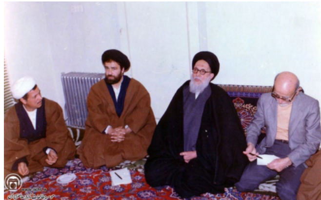
Ayatollah Shariatmadari in talks with members of the Revolutionary Council in Qom. From left to right: Hashemi Rafsanjani, Ahmad Khomeini, Shariatmadari, Mehdi Bazargan.

In response to journalists’ questions, Ayatollah Shariatmadari said that religious leaders must opine on the compatibility of laws with shari’a, but that it was unacceptable for laws to require the approval of the Constitutional Council 71 (or “Guardian Council” in Farsi) in order to be implemented. 72 He noted that the people who had taken over Tabriz’s broadcasting station and government offices had done so to demand power and more rights. Without using the word “autonomy,” he called for more provincial powers, which should be extended to the whole country. 73 On the whole, Ayatollah Shariatmadari seemed optimistic about reaching a resolution and asked that a delegation of the Revolutionary Council and his own representatives be sent to investigate the events of Tabriz and report back to him. 74