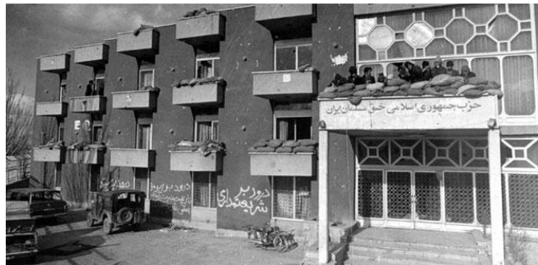
Building in Tabriz housing the revolutionary komiteh (first floor) and MPIRP party headquarters (third floor). Habilian, undated.

Though detailed reports on what happened in the last two weeks of December and early January are scarce, it is clear that clashes continued between the revolutionary guards and other anti-Shariatmadari forces and pro-Shariatmadari protesters. While the clampdown on independent news sources continued with the expulsion from Tehran of a reporter from the Associated Press 113 and two correspondents of Time magazine, 114 pro-government revolutionary guards attempted to take over the MPIRP headquarters in Tabriz.