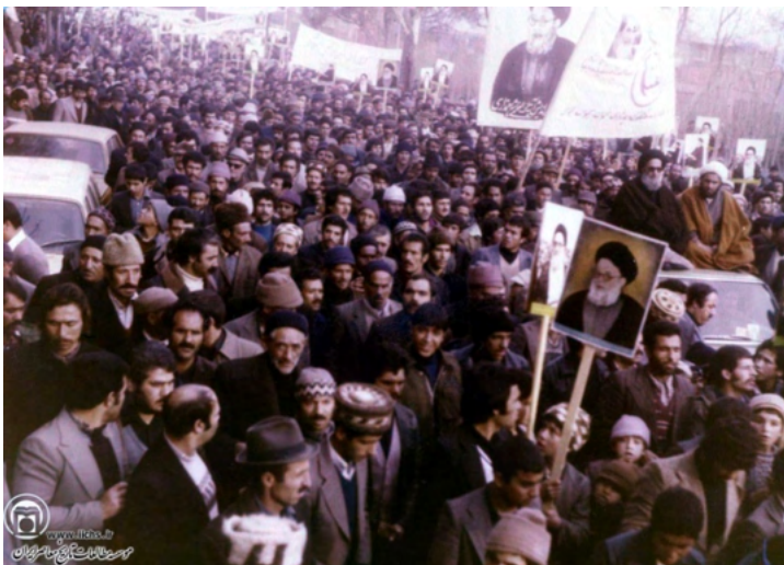
Pro-Shariatmadari demonstration.

Ayatollah Shariatmadari’s support of the MPIRP provoked an immediate reaction from Ayatollah Khomeini’s supporters, in the form of an April 22, 1979, article published in Ettelaat daily by Sharia judge Sadeq Khalkhali – notorious for his aggressive capital prosecutions. Entitled “Excuses Should be Taken from the Hands of Traitors,” the article argued specifically that the existence of the MPIRP, and Ayatollah Shariatmadari’s support for it, indicated division among the religious leaders, which could be exploited by those opposed to the Islamic Republic. Offended, supporters of Ayatollah Shariatmadari, called upon by the MPIRP, responded two days later with their first real show of power in Azerbaijan and beyond, issuing statements, organizing mass street demonstrations, and closing down Tabriz. 15