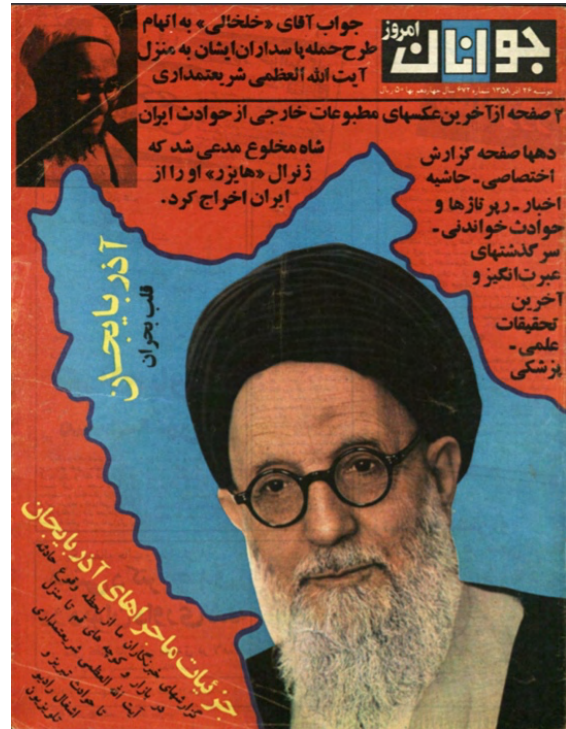
Cover of Javan-e Emrooz Magazine, December 17, 1979. Title story: “Details on the Events of Azerbaijan”

While Ayatollah Shariatmadari’s letter, which was prevented from being broadcast or printed, was distributed as leaflets by his followers, 105 Ayatollah Khomeini’s statements decrying the Tabriz protest as