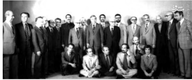
The interim government.

In the weeks following the February 1979 revolution, Ayatollah Khomeini and his supporters took further steps to consolidate their power. The secretive Revolutionary Council – whose members, predominantly clerics who still lead the