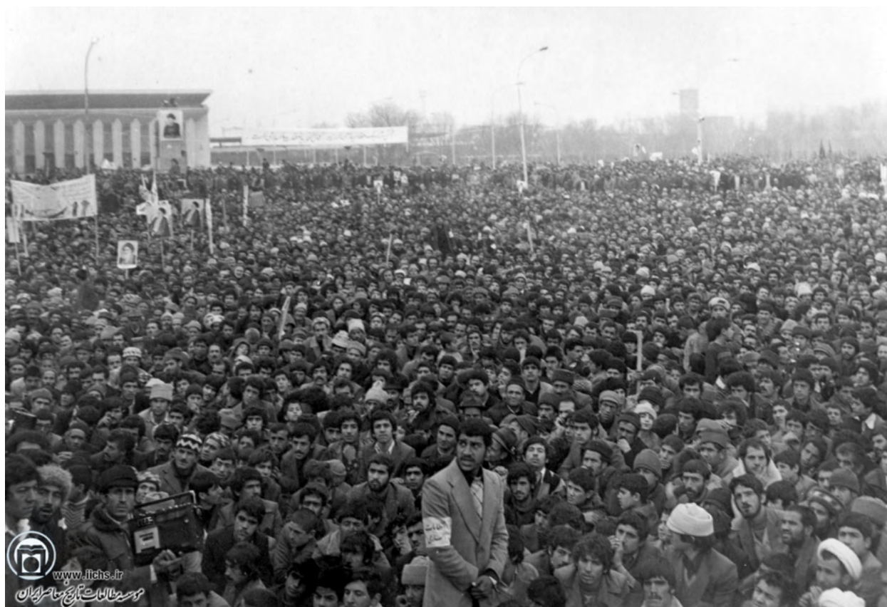
Rally of the Muslim People's Islamic Republic Party gather in Tabriz. Institute for Iranian Contemporary Historical Studies, undated.

Far from being representative of Iranian culture or from being "overwhelmingly approved by the people," 163 the constitutional law was endorsed by neither the most prominent and respected members of the religious establishment nor a majority of the Iranian public. The Islamic Republic leaders owe their survival to violence and the ironclad monopoly on power granted to them by an undemocratic constitution drafted in dubious circumstances and in a context of electoral fraud and vigilante violence.